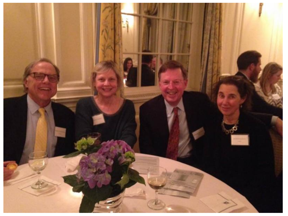
2017 Annual Benefit

At the conclusion of the fiscal year, the museum had approximately $410,000 in its endowment. The museum has four endowment accounts, the largest of which is unrestricted with approximately $364,700. The other three accounts are restricted as funds designated for the Curator, Tour Guides, and Special Projects. The Gibson House Museum ended the year on strong financial footing, and we will continue to work toward increasing its financial stability.