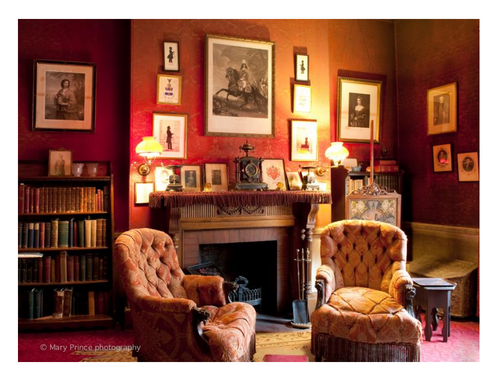
Second floor red study

Proceeds to benefit the preservation of the Gibson House Museum